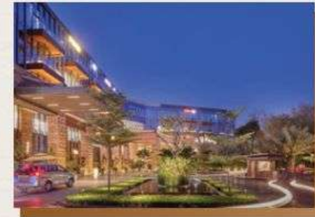
Eldeco Centre New Delhi