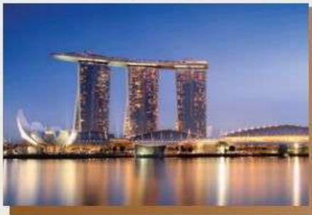
Marina Bay Sands Singapore