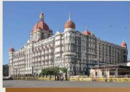
Taj Mahal Palace Hotel Mumbai